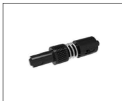
22052 for 22040 & 22042