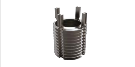
Carbon steel inserts

Wixroyd inserts are easy to install and remove, without the need for special drills, taps or pre-winder tools. The 'locking keys' on threaded inserts are easily driven down into the thread of the surrounding base material – locking the insert securely in place.