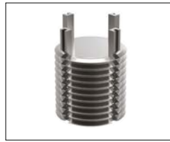
22042 - Metric - Stainless Steel Use installation tool no. 22052.