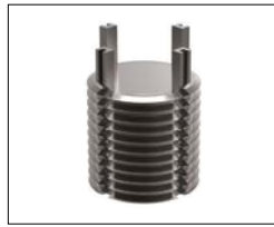
22040 - Metric - Carbon Use installation tool no. 22052.