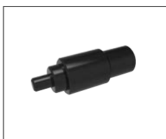
22054, 22058 for 22020, 22024, 22030, 22034,