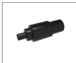
22062 for 22002 & 22006