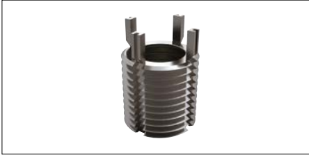
Carbon steel inserts

Wixroyd inserts are easy to install and remove, without the need for special drills, taps or pre-winder tools. The 'locking keys' on threaded inserts are easily driven down into the thread of the surrounding base material – locking the insert securely in place.