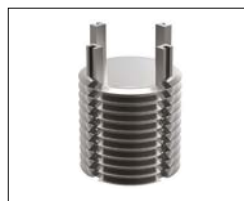
22042 - Metric - Stainless Steel Use installation tool no. 22052.