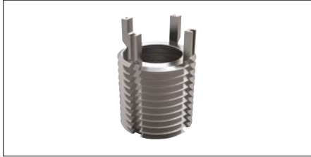
Stainless steel inserts