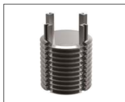
22040 - Metric - Carbon Use installation tool no. 22052.