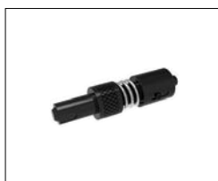
22052 for 22040 & 22042