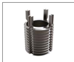
22030 - 22034 - Inch - Thinwall - Heavy Duty - Extra Heavy Duty Use installation tool no. 22054, 20058.