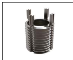
22006 - Heavy Duty - Metric Use installation tool no. 22062.