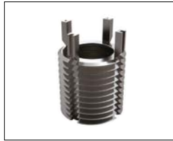
22000 - Thinwall - Metric Use installation tool no. 22060.