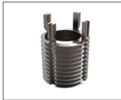
22006 - Heavy Duty - Metric Use installation tool no. 22062.