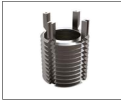
22002 - Heavy Duty - Metric Use installation tool no. 22062.