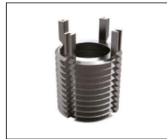
22030 - 22034 - Inch - Thinwall - Heavy Duty - Extra Heavy Duty Use installation tool no. 22054, 20058.